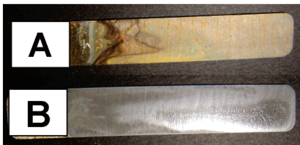
Figure 3. Phenomenology of the anticorrosive effect of Ca-PBTC films on carbon steel. The upper specimen is the “control” (A), no inhibitor present. Surface “cleanliness” in the lower specimen (B) by a 1 mM \text{Ca}^{2+} /PBTC equimolar combination is demonstrated, but overall metal loss is enhanced (see text).

1:1 molar ratio (under identical conditions used to prepare crystalline [\text{Ca}(\text{H}_3\text{PBTC})(\text{H}_2\text{O})_2 \cdot 2\text{H}_2\text{O}]_n ) appears to offer excellent corrosion protection for carbon steel (Figure 3). However, based on mass loss measurements 25,26 the corrosion rate for the “control” sample is 0.16 mm/year, whereas for the “Ca-PBTC” protected sample 1.17 mm/year, a \sim 10 -fold increase in corrosion rate. Therefore, PBTC essentially enhances the dissolution of “bare” metal, presumably forming soluble Fe-PBTC complexes. In contrast to aminomethylene-tris-phosphonate (AMP), 10a PBTC does not form stable metal–phosphonate protective films. This is consistent with the low complex formation constant for Ca-PBTC, 4.4. 27